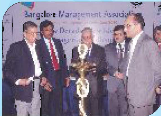
BMA Annual Convention 2010 - Inauguration by Justice Shri M. N. Venkatachalalah, Former Chief Justice, Supreme Court, Government of India