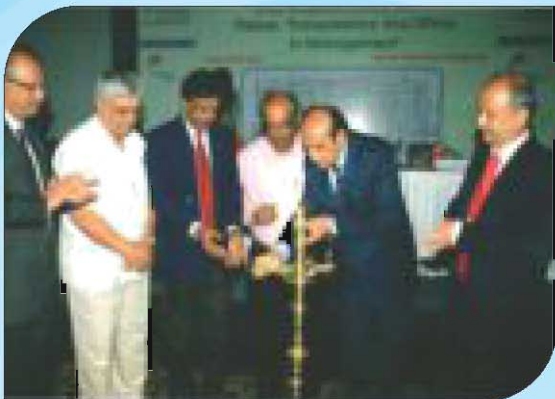
BMA Annual Convention 2011 Inauguration by Justice Shri N. Venkatachala, Former Justice, Supreme Court & Lokayukta, Government of Karnataka