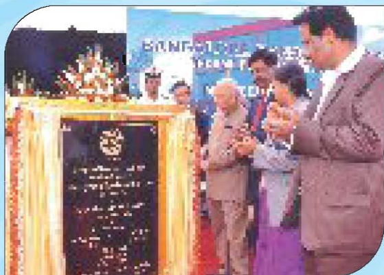
Bhoomi Pooja & Foundation Stone laying for Management Development Centre by His Excellency Hans Raj Bharadwaj, Hon'ble Governor of Karnataka