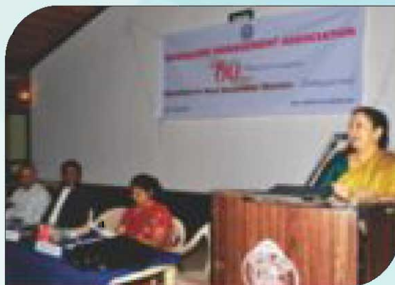
Workshop of Next Generation Women March 10, 2012 Inauguration by Ms. Kavary Monnappa, Additional Commissioner of Commercial Taxes, Govt. of Karnataka