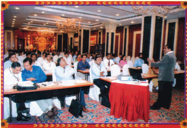
A view of delegates at the workshop on "Emerging Trends in Labour Laws & Industrial Relations" at Hotel Le Meridian, on 25th & 26th September, 2009.