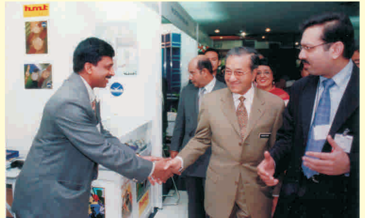
Dr. Mohammed Mahathir the then President of Malayasia along with Shri Sanjiv Goenka

BMA congratulates the new president on this occasion. Let me mention here the privilege and pleasure that I met Shri Sanjiv Goenka earlier at Kuala Lumpur (Malaysia) in May 2001, when he was the President of CII President and had lead a business delegation on Technology Mission coinciding with the visit of former Prime Minister Shri Atal Bihari Vajpayee to Malaysia