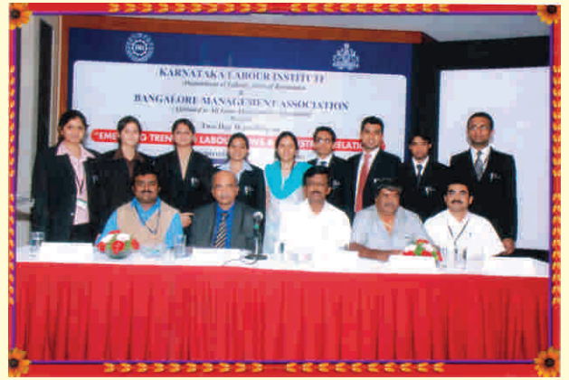
Students of Indian Business Academy volunteers at the workshop seen along with Officers of BMA.